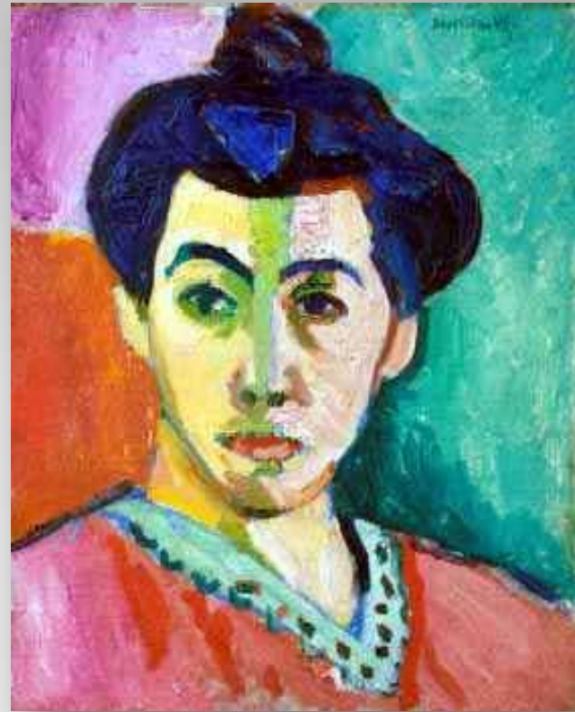
Madame Matisse, by Henri Matisse, 1905