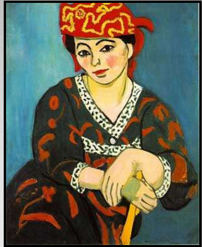
Matisse, "Madras Rouge," 1907