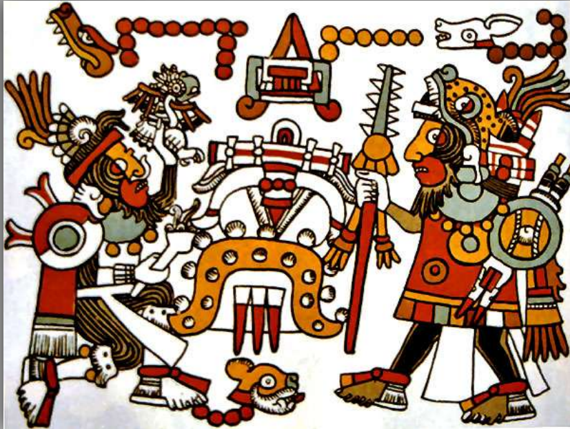
Eight Deer Jaguar Claw, from the Codex Zouche-Nuttall, 14 th Century, MesoAmerican Mixtec Culture of Oaxaca.