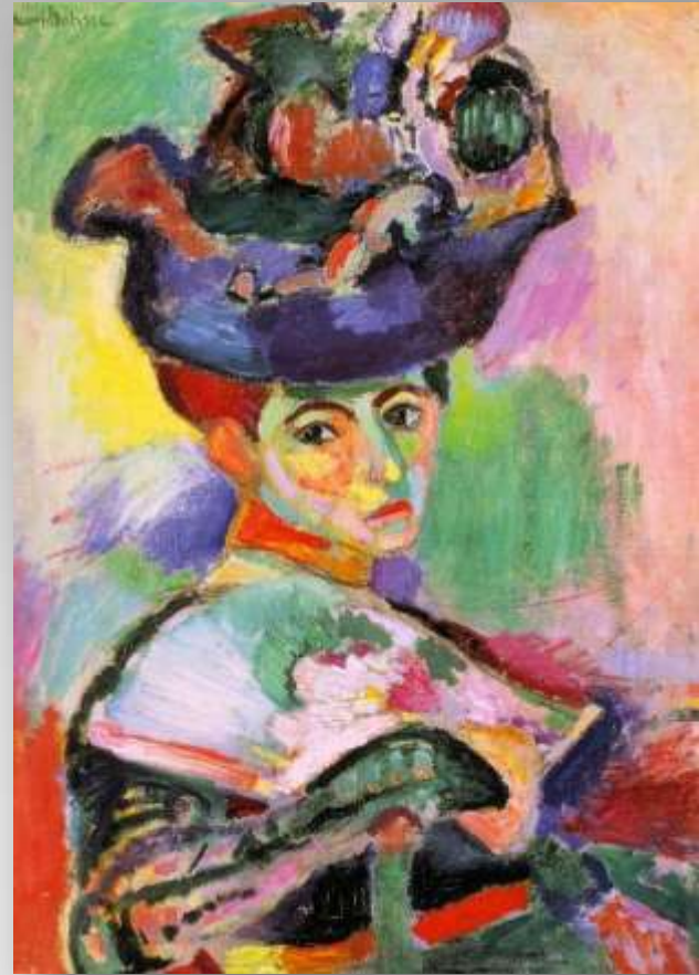
“Woman with a Hat” 1905